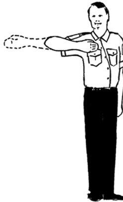
figure 2(b) from right side