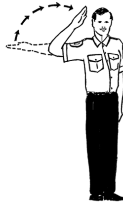
figure 2(c) from right side