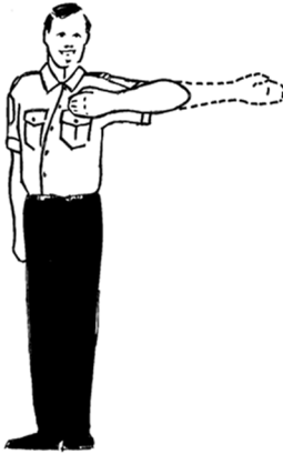
figure 2(a) from left side